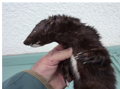
American mink carcass

A dead mink was found above the high water mark near Achiltibuie at the beginning of March following several reported sightings around Christmas and the New Year. This highlights the need for continued vigilance to remove the species from Sutherland and prevent recolonisation. Many thanks to our dedicated volunteers in the area.