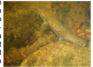
Trout released from Badna Bay trap 2013

In early April the smolt trap will once again be installed at Badna Bay in the hope to catch the smolt run (usually May in west Sutherland). Kelts will also be tagged on their way downstream. The traps help to get a far better idea of the smolt output from the system, and such information can be used in future management and conservation plans for salmon and sea trout.