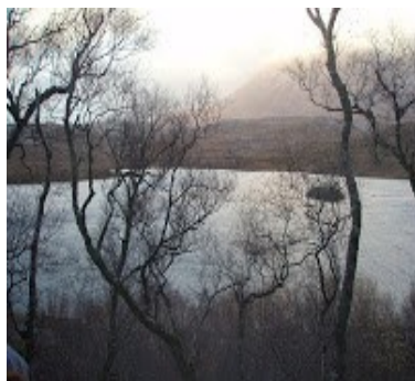
View of Loch Stack from Stack Woods (S.Marshall)

Despite being busy preparing the reports from the last field season, on occasion The Trust did manage to escape the office during the winter. Before Christmas we were out in Stack Woods establishing a series of quadrats at known coordinates to collect baseline data from which to assess the effects of deer grazing and trampling on vegetation.