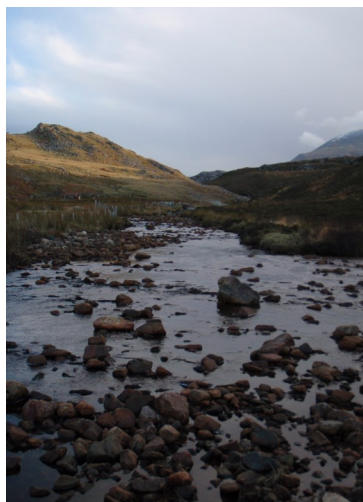
Upstream towards the old dam, Achriesgill

The Achriesgill catchment is currently being surveyed with the intention of producing a new catchment management plan for the area. The SFCC habitat surveys started downstream in mid January and will progress into the Spring.