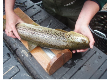
J77, The largest recaptured sea trout at the Polla, 2013

Subject to funding it is hoped to continue with the post smolt sweep netting in the Laxorfd, Polla, Dionard and Kinloch estuaries. The Polla and Laxford will be sampled monthly between March and October, and the Dionard and