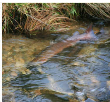
Possible salmon spawning (S.Barnes)

In addition there was much excitement following signs of salmon spawning in the Laxford catchment in attempts to get some decent footage. There did not appear to be much activity before Christmas, although we were lucky to see some movements in the new year when we went out counting redds. Unfortunately there did not seem to be as many fish or redds compared to previous years, with little signs of gravel disturbance in areas that are known to be good spawning habitats. Fewer dead kelts were also observed.