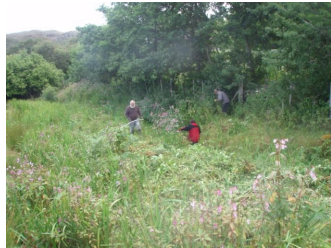
Balsam clearing at Nedd

Once again Himalayan Balsam will be removed in August from areas of Nedd and Clashnessie as part of The Trust's biosecurity remit. Much progress has been made in recent years thanks to the Assynt Field Club volunteers. Few plants now remain although the smaller plants amongst reeds and nettles are harder to spot! In addition patches of Japanese knotweed will be removed from the Reay Forest Estate.