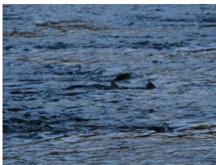
Spawning fish (S Marshall)

Last November and December saw the WSFT staff crawling around in the heather, armed with cameras, in an attempt to video some spawning fish. While the underwater filming proved a bit hit and miss—more miss, to be honest! - there was still a lot of activity to be seen. The video's can be viewed from the website or on You-tube.