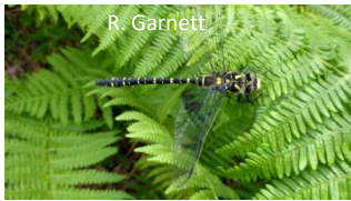
Common hawker dragonfly (with its broad hind wings spread when at rest)