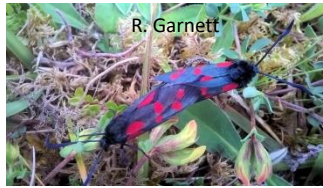
Day flying six-spotted burnet moth