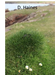
Otter latrine (fertile, green hump)