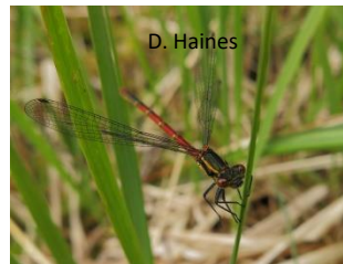
Damsel fly (with 4 wings that fold in at rest)