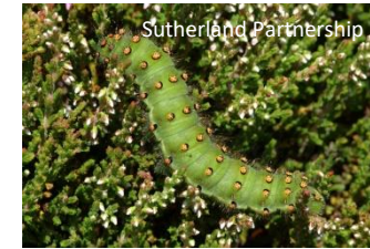
Emperor moth caterpillar