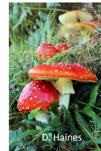
Fly agaric (poisonous)